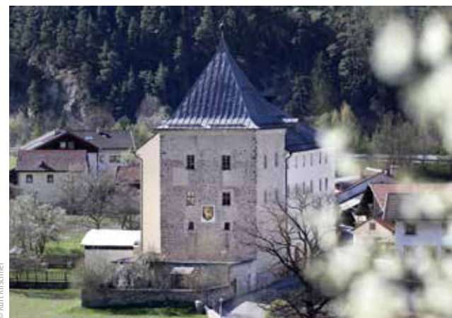
The castle in the middle of the village bears witness to a bygone era.

Another highlight around every corner – culture and lots of sights await you in the Tyrolean Oberland. It's not just the multitude of cycling and walking routes which make the Tyrolean mountain region a remarkably varied location. The Tyrolean Oberland has also got a lot to offer in terms of cultural and traditional sights!