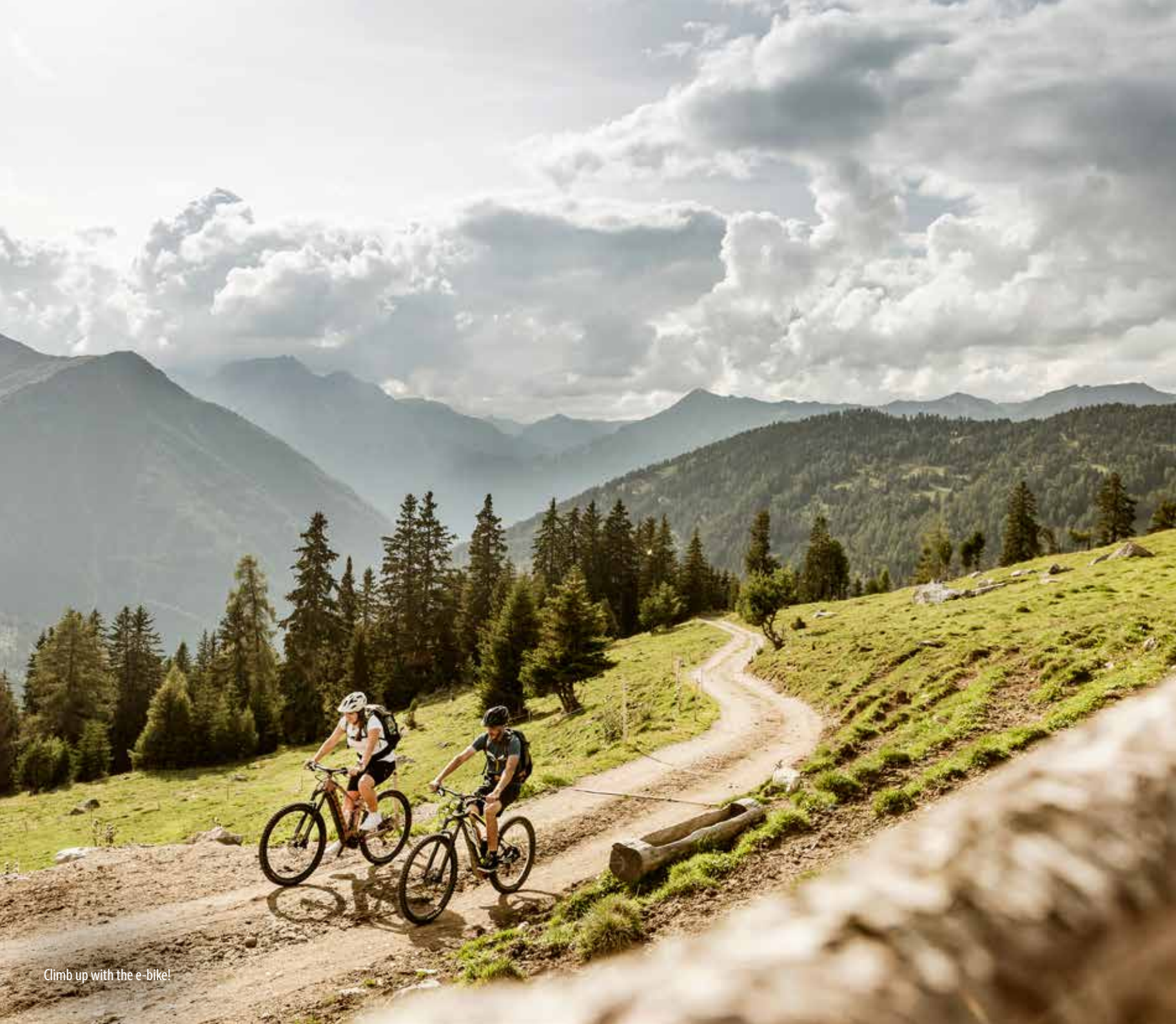
Climb up with the e-bike!