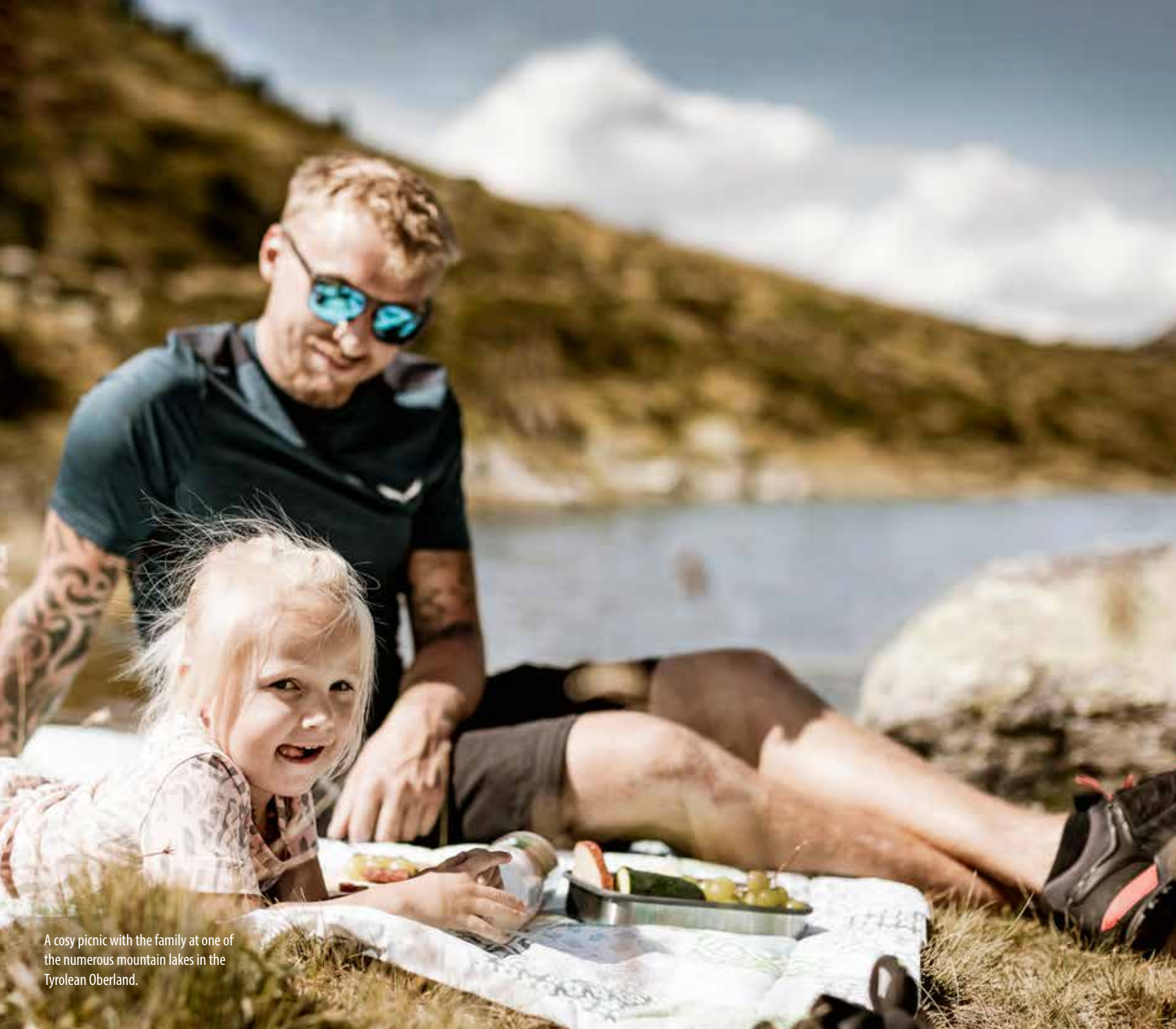
A cosy picnic with the family at one of the numerous mountain lakes in the Tyrolean Oberland.