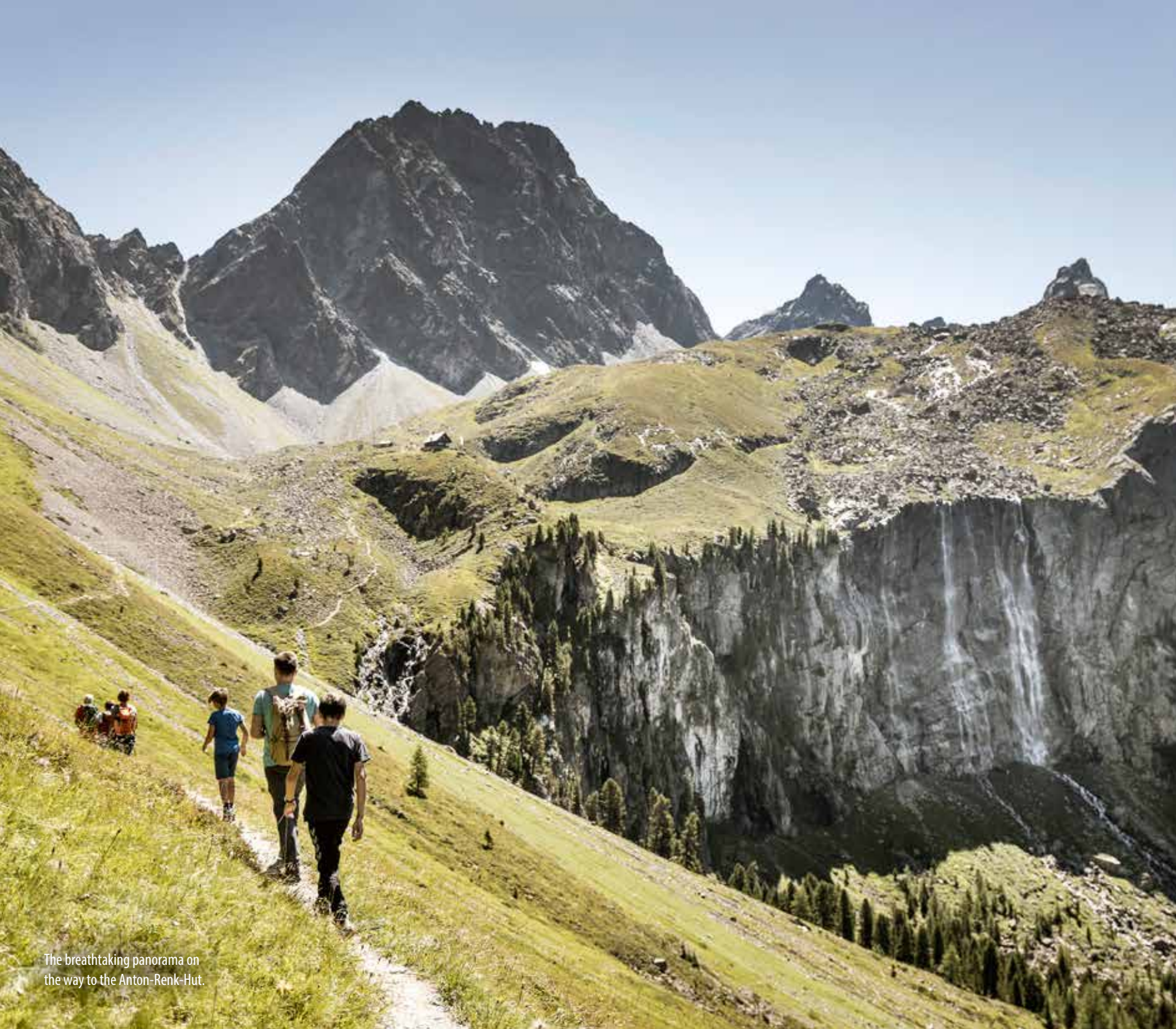
The breathtaking panorama on the way to the Anton-Renk-Hut.