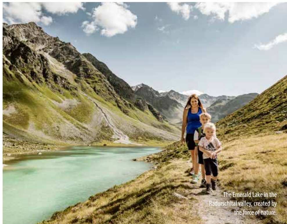
The Emerald Lake in the Radurschltal valley, created by the force of nature.