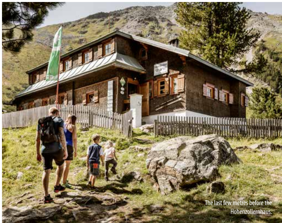
The last few metres before the Hohenzollernhaus.