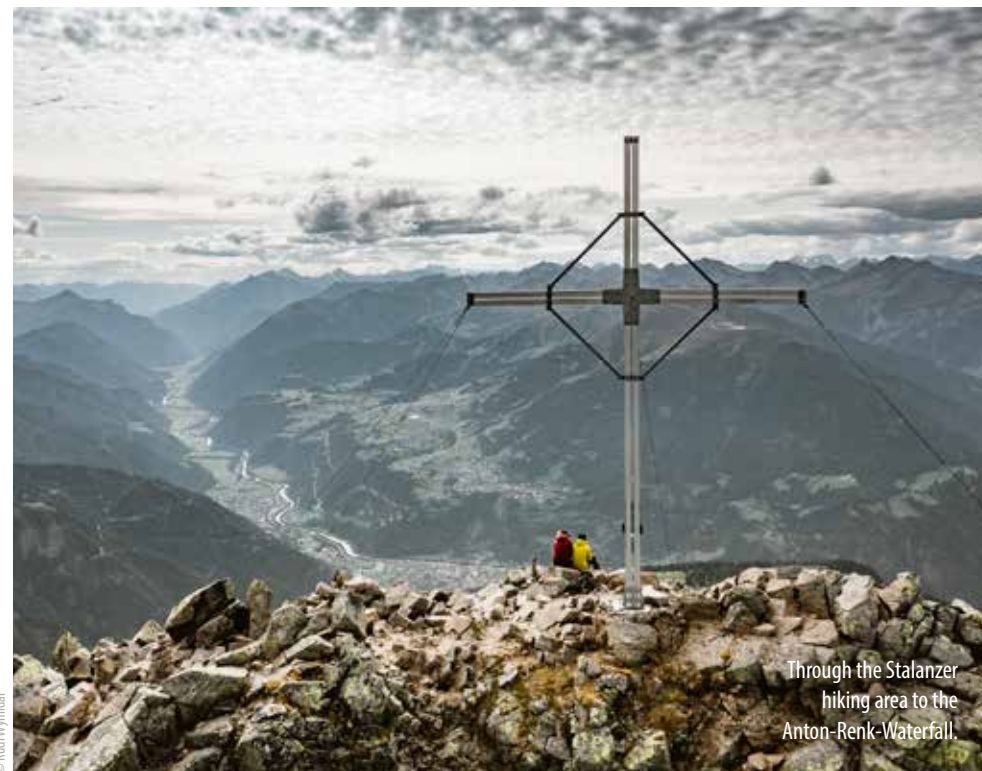
Through the Stalanz hiking area to the Anton-Renk-Waterfall.

The prettiest views and hiking highlights of the Alps are not just reserved for experienced mountain lovers in Tyrol. Thanks to our hiker's buses, hikers who are no top athletes, children or mountain beginners can also get to starting points from which it is not that far to various hiking destinations in our mountains. What is the best part? A car-free holiday guaranteed! Protects the environment and your nerves.