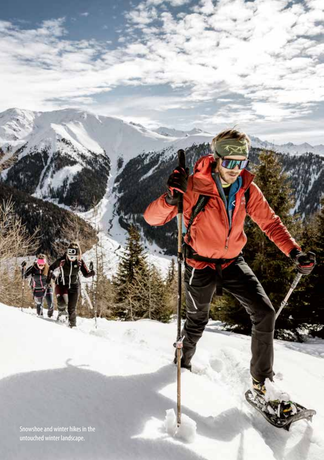
Snowshoe and winter hikes in the untouched winter landscape.