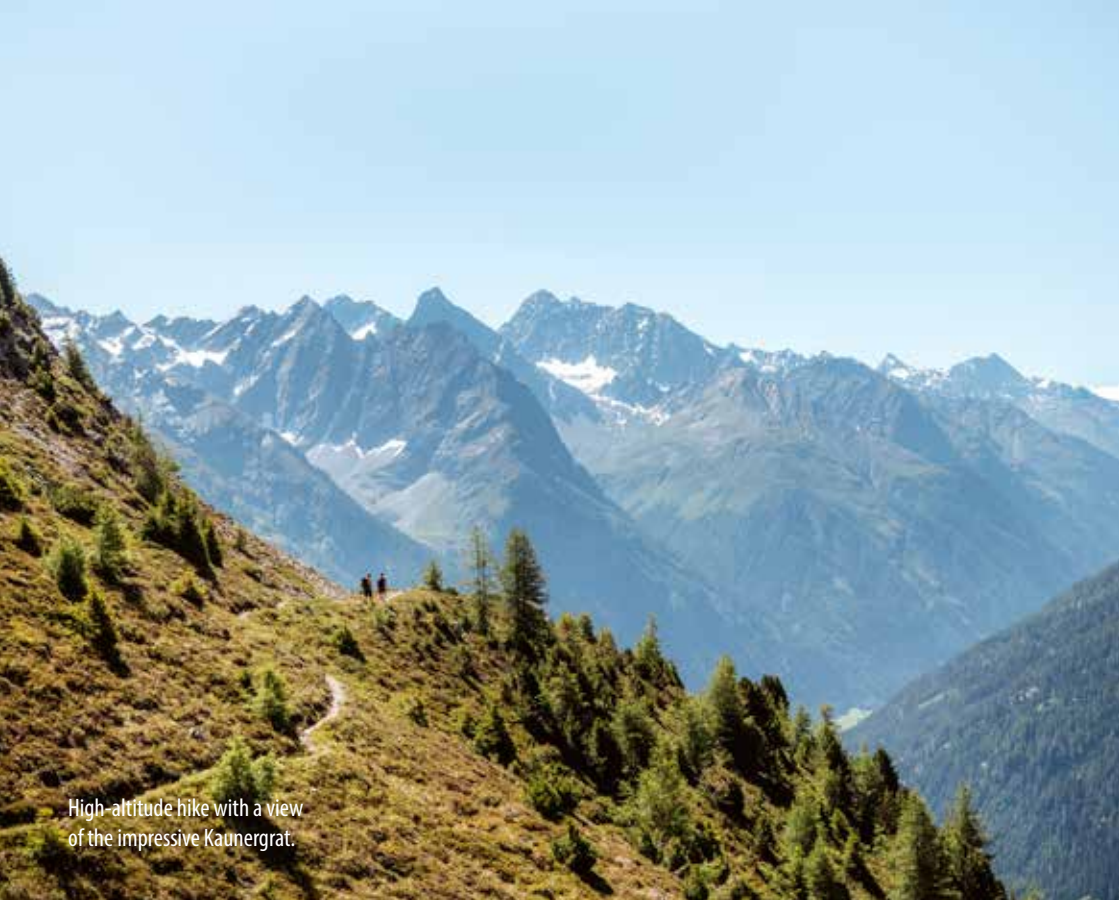
High-altitude hike with a view of the impressive Kaunergrat.